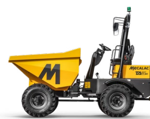
TA3H / TA3SH